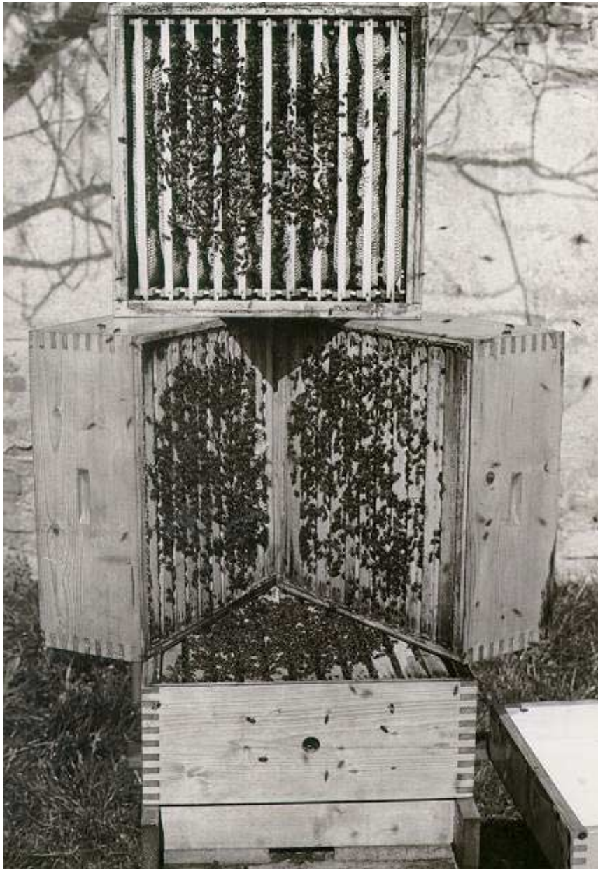
Fig. 2 The colony wintered in 4 shallow hive bodies (41 frames 420 x 170 mm) and opened in April 14, 1981